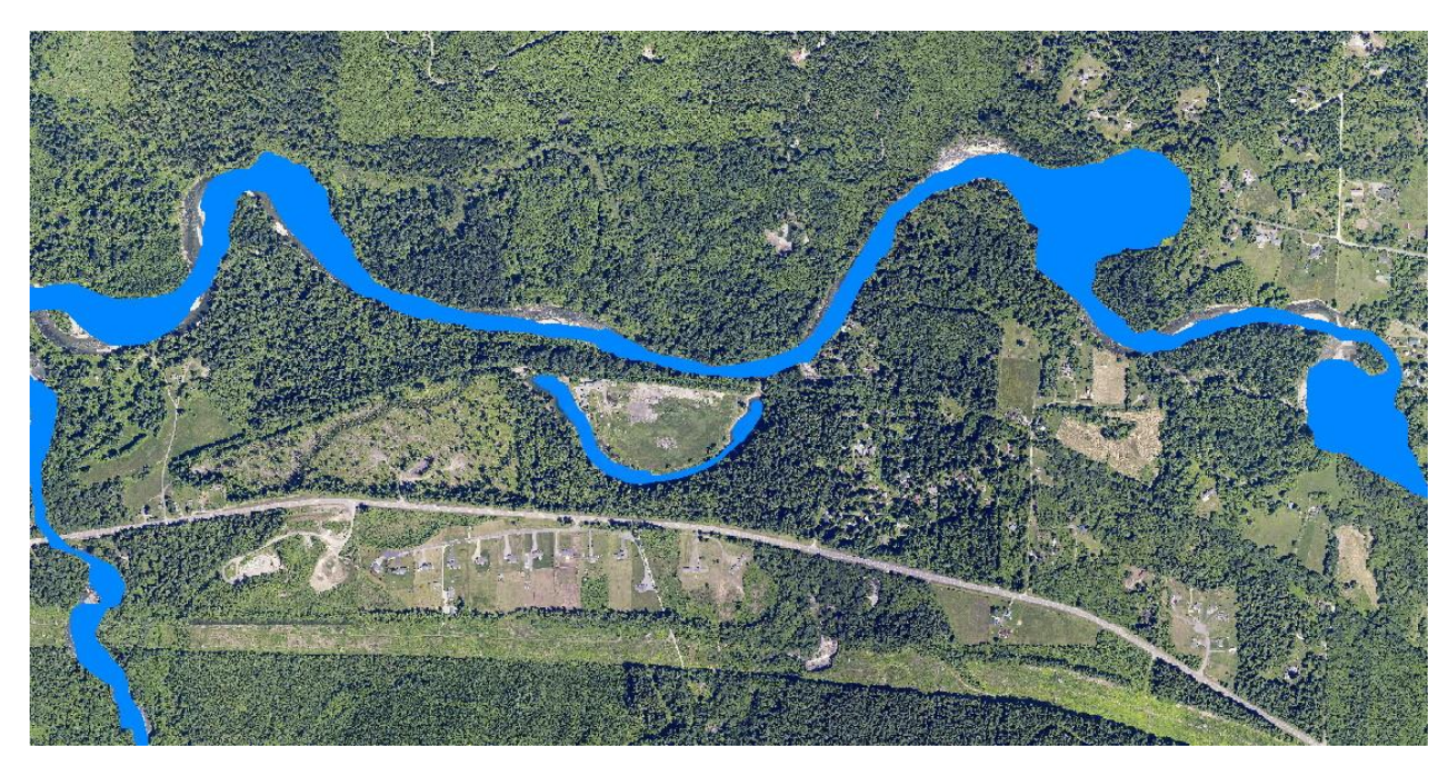
2012 Aerial photo

The 2012 aerial photo is enhanced with blue designation of "water", but the isolated Blue Pool is clearly visible . . . and it all started when the railroad cut off part of the river.